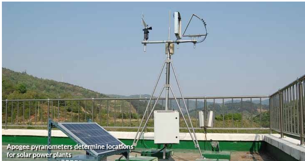
Apogee pyranometers determine locations for solar power plants

Once K-water has collected all of the data from the sensors, it will be reviewed to find the best location for the new power plants and the optimal angles for the solar panels to collect power throughout the day.